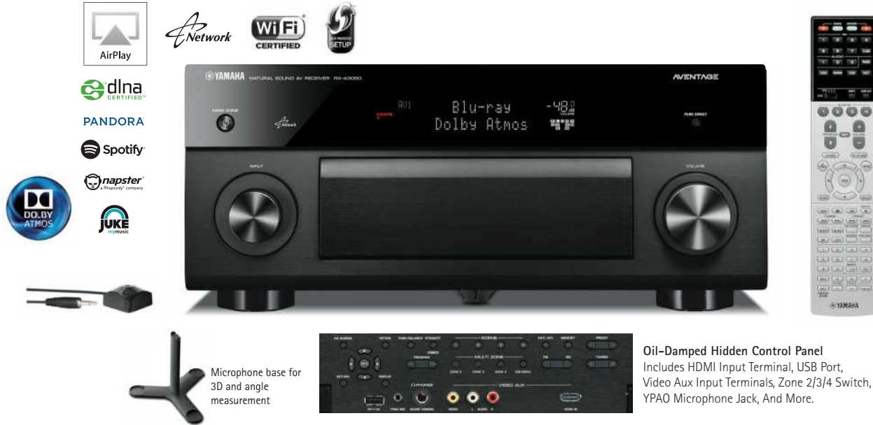
Oil-Damped Hidden Control Panel Includes HDMI Input Terminal, USB Port, Video Aux Input Terminals, Zone 2/3/4 Switch, YPAO Microphone Jack, And More.

AVENTAGE AV Receiver ready for Dolby Atmos® and CINEMA DSP HD 3 for the ultimate 3D AV experience. With many outstanding features including 11.2ch expandability, the latest super-high quality ESS DACs, High-Resolution audio playback support and Advanced HDMI Zone Switching.